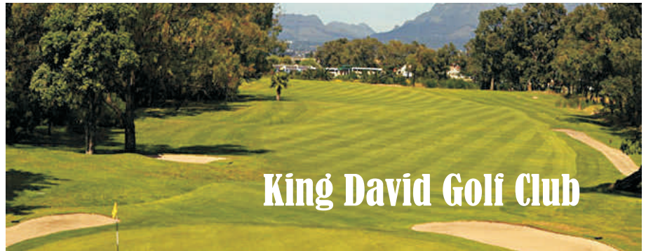
King David Golf Club

From the centre of Cape Town , proceed east on the N2 . Exit the N2 at the M22/Borcherds Quarry (Exit 18) off-ramp. Proceed along Airport Approach Road (heading towards Cape Town International Airport), and after 1km, exit left onto Borcherds Quarry Street(M22) . Proceed along Borcherds Quarry Street(M22), the airport will be on your right-hand side, then turn left into Modderdam Road(M10) . On Modderdam Road(M10), take the first left into Palotti Road , and the golf club will be on your left-hand side. From the entrance/exit of the University of the Western Cape , turn left into Modderdam East Road , traveling towards Table Mountain in the distance. Cross De La Rey Rd and Stellenbosch Rd . The Airport will be on your left side. Cross the Borcherds Quarry intersection and after about 500m, turn left into Pallotti Rd . Follow the signs to the golf club.